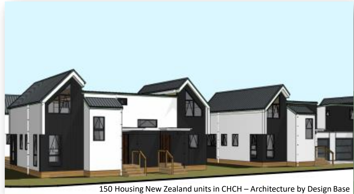
150 Housing New Zealand units in CHCH – Architecture by Design Base