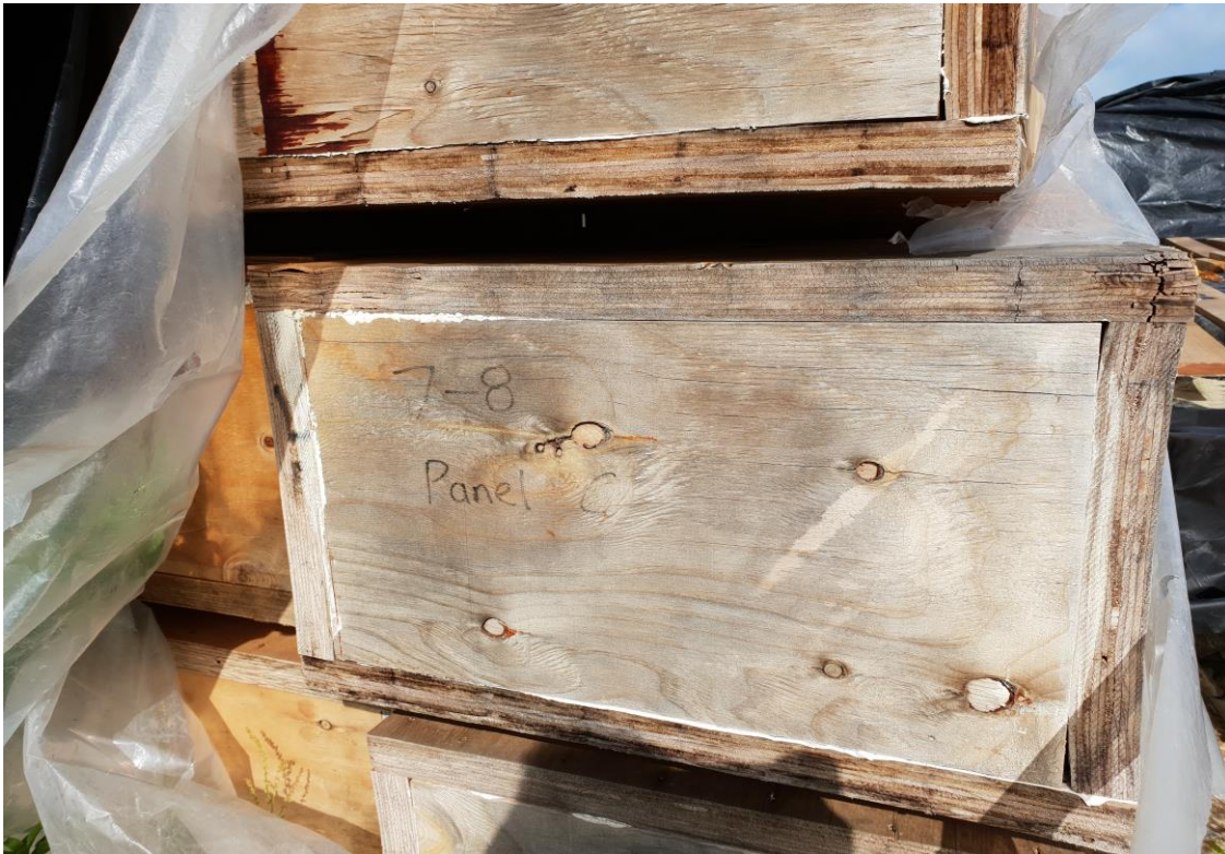
Figure 5: These Potius Panels have had long term exposure to weather resulting in swelling, discolouration and some splitting.

Where possible limit the amount of exposure of Potius panels to the exterior environment. Moisture and UV sunlight can both discolour but also affect the dimensional tolerances of the panels. In a horizontal situation, where water may pool on the panels, it is recommended that the water is swept off the panels or the panels are covered before a roof is installed. The panels can handle a certain amount of weathering without effecting their structural performance because we use materials such as crossbanded LVL with a marine grade adhesive, PU foam insulation and fabrication adhesive and mechanical fasteners.