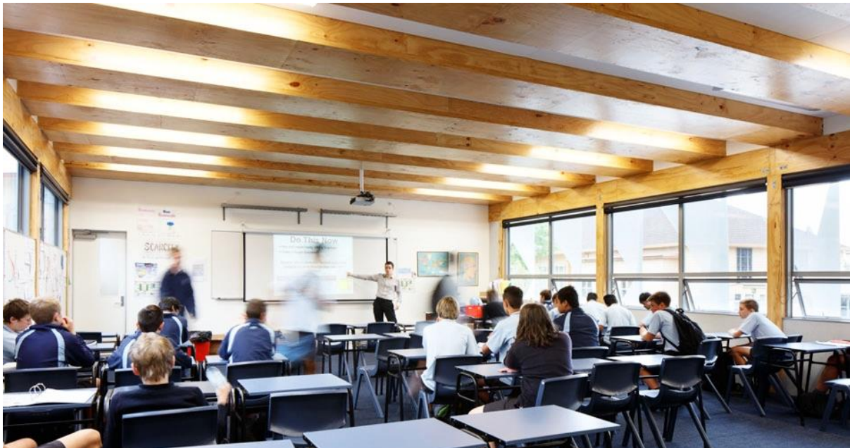
Figure 1: Nelson College - A two storey classroom teaching block with a Potius midfloor.

Potius Panels are a fabricated panel system built predominantly from engineered timber, resulting in a structurally efficient system with high dimensional accuracies. Often, Potius Panels will provide the structural, thermal and fire performance requirements of a building system and sometimes also provide the acoustical and air barrier systems, depending on the design.