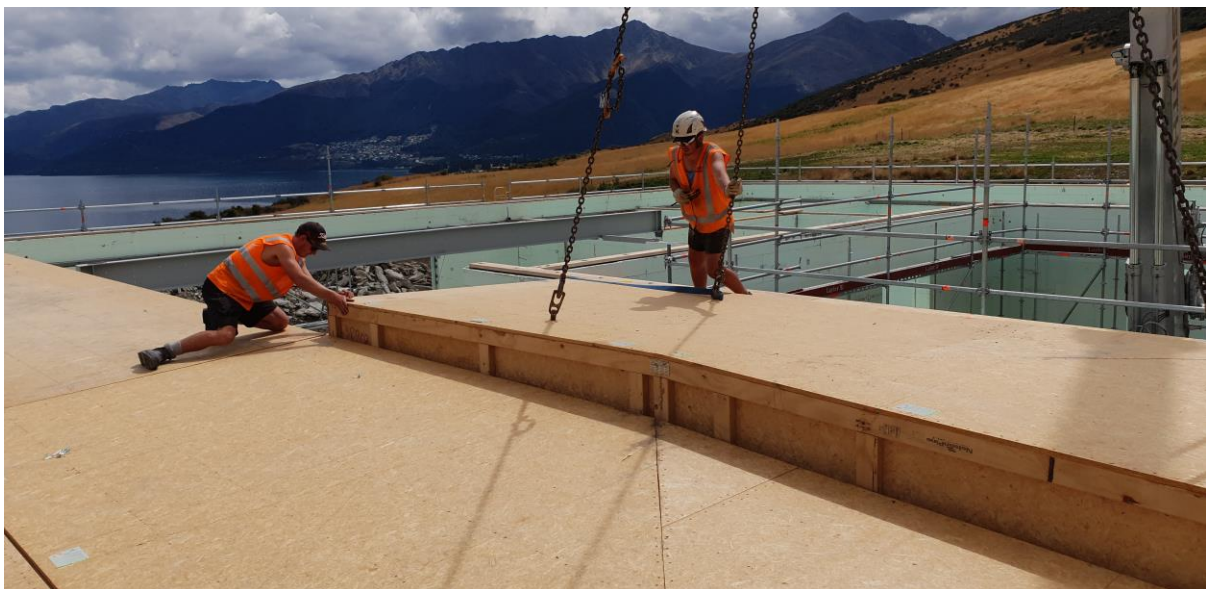
Figure 4: Lifting in a residential midfloor using lifting hooks (Wasp)

Potius Panels are made from Structural engineered wood products, which are visually attractive, however can contain manufacturing marks, resin marks, knot holes and other timber related defects. Sanding the panels, either during prefabrication (by request) or on site can enhance the visual appearance of the panels. If the panels are to be exposed in the finished building, then we recommend that the panels are sealed with an appropriate paint or clear coat sealer.