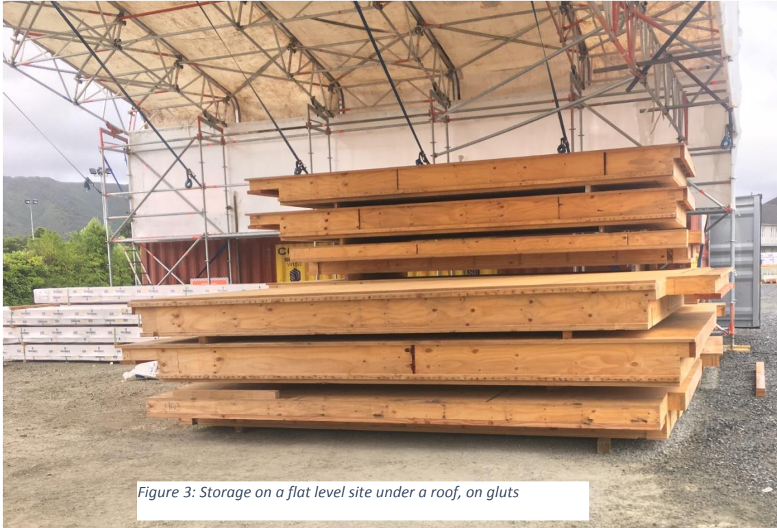
Figure 3: Storage on a flat level site under a roof, on gluts

When unloading panels check all packs to ensure panels have not shifted or been damaged in transit. Take photos for insurance purposes. The panels shall be stored in their packs on level flat 100x100 gluts with no twist. The panels should never be placed on uneven ground, even for a short period. The wrapping shall be maintained over the panels to keep rain out and/or ideally under cover. If a roof is not available use tarps as a primary protection against the elements. Adequate ventilation and ground clearance must be maintained to ensure moisture does not build up within the packs under the plastic. Panels should not get wet as this may cause swelling, distortion and discolouration.